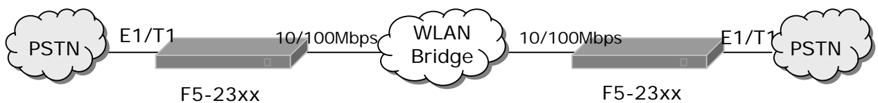
E1/T1 Transmission over WLAN